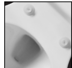
EASY•CLEAN & CHANGE™ LIFTS OFF FOR EASY CLEANING