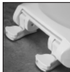
EASY•CLEAN & CHANGE™ HINGE

Ring thickness is 5/8" Ring thickness including the bumper is 7/8" Height of the seat with cover is 1-7/8"