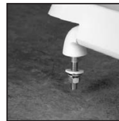
EXTERNAL CHECK HINGES WITH 300 SERIES STAINLESS STEEL POST

Ring thickness is 1" Ring thickness including the bumper is 1-3/16"