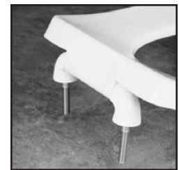
EXTERNAL CHECK HINGE