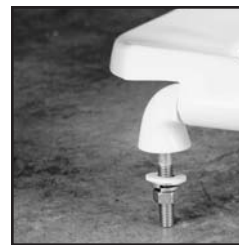
CONCEALED CHECK HINGES WITH 300 SERIES STAINLESS STEEL POST

Ring thickness is 1" Ring thickness including the bumper is 1-3/16"