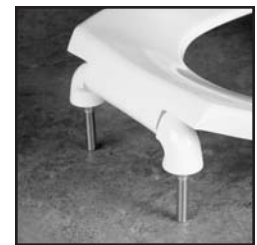
CONCEALED CHECK HINGE