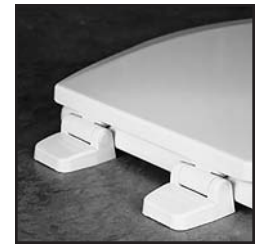
STURDY HEXTITE™ HINGE