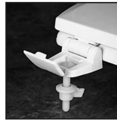
TOP-TIGHTENING HEXTITE™ HINGE

Ring thickness is 3/4" Ring thickness including the bumper is 1-1/16" Height of the seat with cover is 1-7/8"