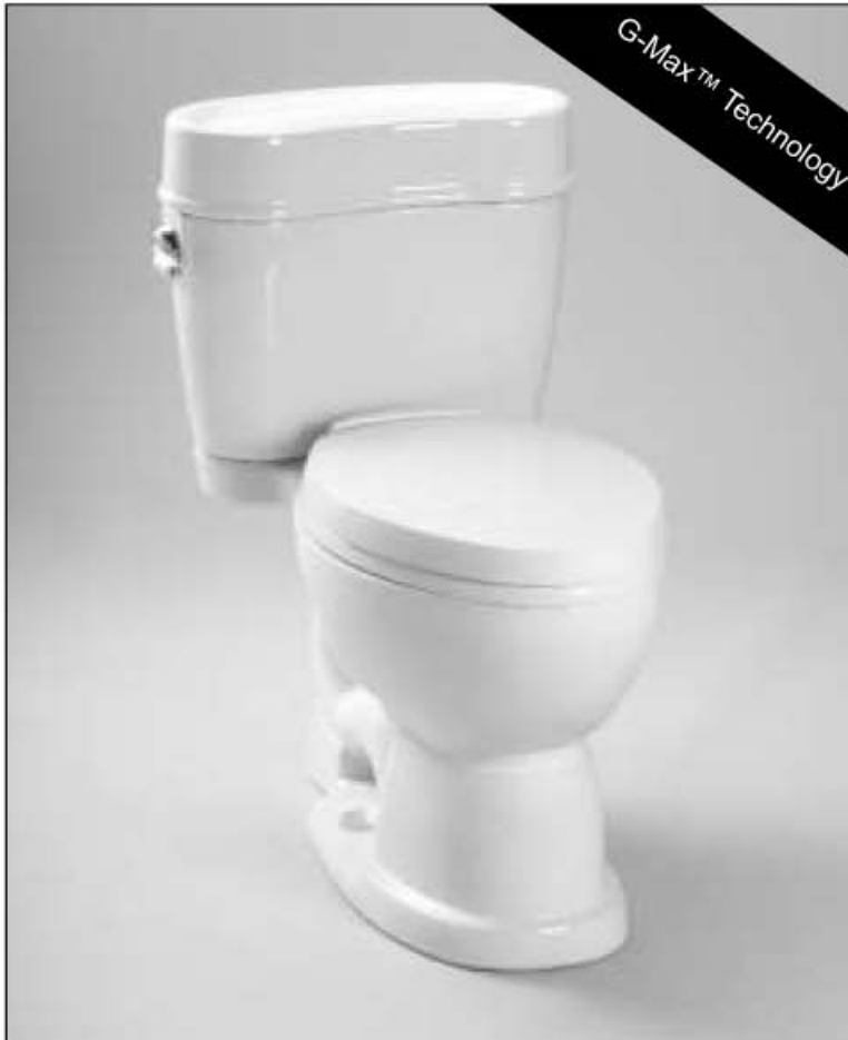
MS756204SF - Mercer™ Toilet with SoftClose® Oval Seat